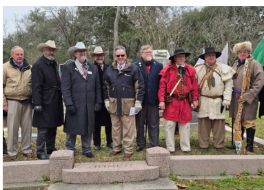
Members of The Sons of the Republic of Texas attending the Anson Jones Ceremony.

Join us next year on February 19 as we expand the scope of the Anson Jones ceremony to include our newly recognized SRT Statehood Day event.