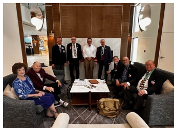
Chapter members and spouses gathered together during a break at the annual meeting in College Station, Texas.

The Sam Houston Chapter was well represented with many of our Chapter Officers in attendance. At the Summerfield G. Roberts Award lunch-